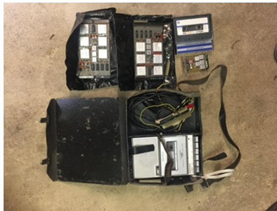
Previously unidentified CE Tool