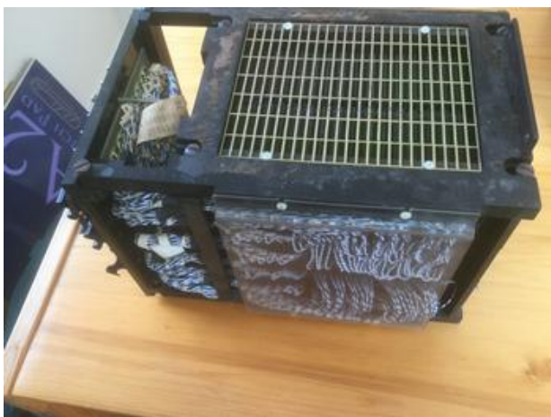
Core Storage Module